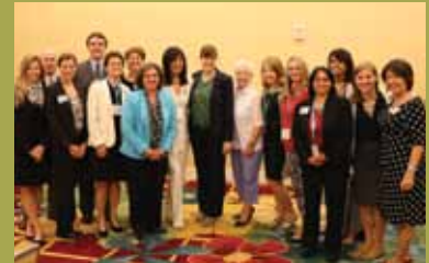
WoWE Lunch and Q&A with Andrea Jung Just before WINDPOWER 2015 WoWE partnered with GE to host a special lunch with Andrea Jung, CEO of Grameen America, former CEO of Avon, and member of the GE Board of Directors

Your company can be part of this great effort! Email giving@womenofwindenergy.org for more information.